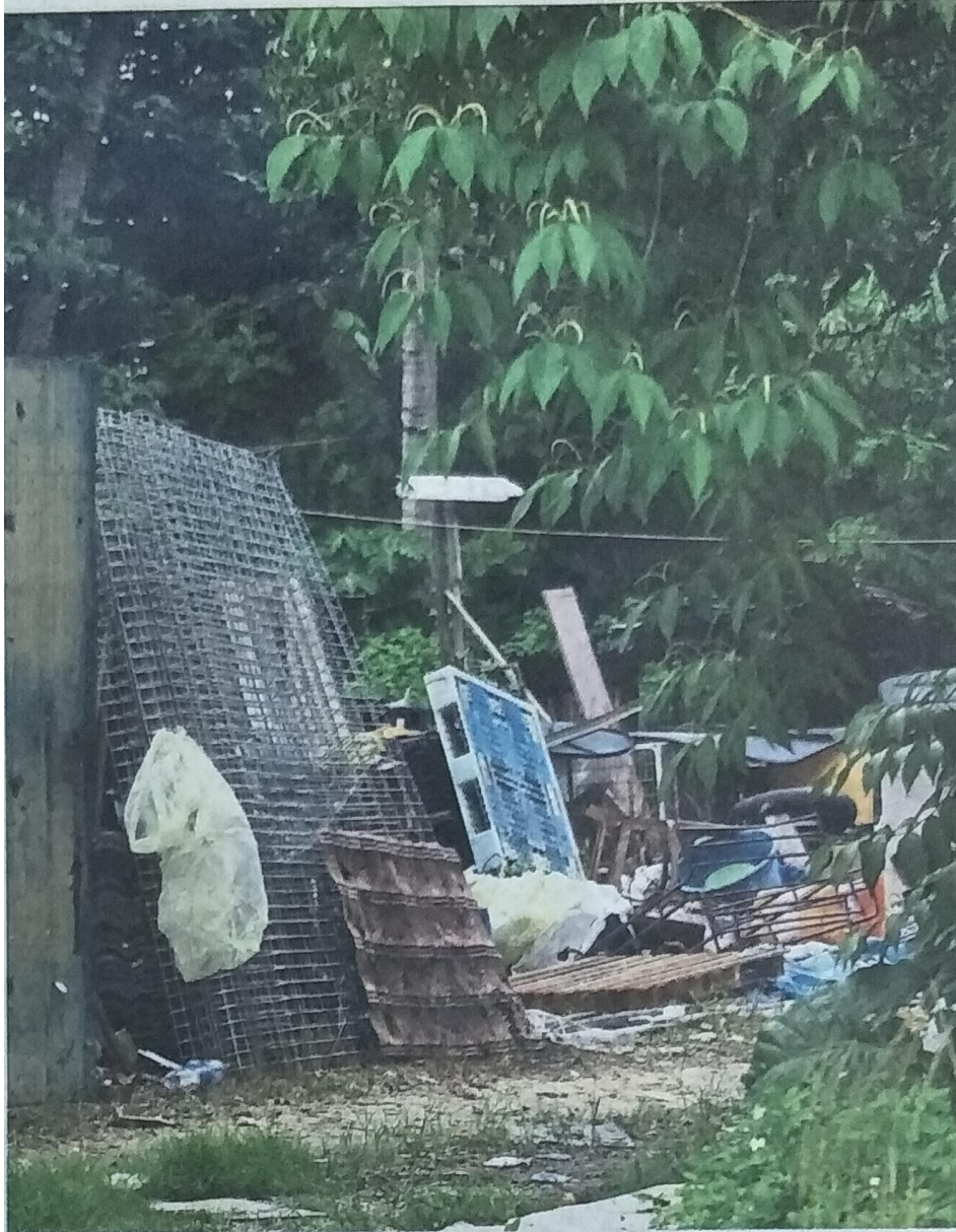
An area near the river has been turned into an illegal recycling centre of sorts.