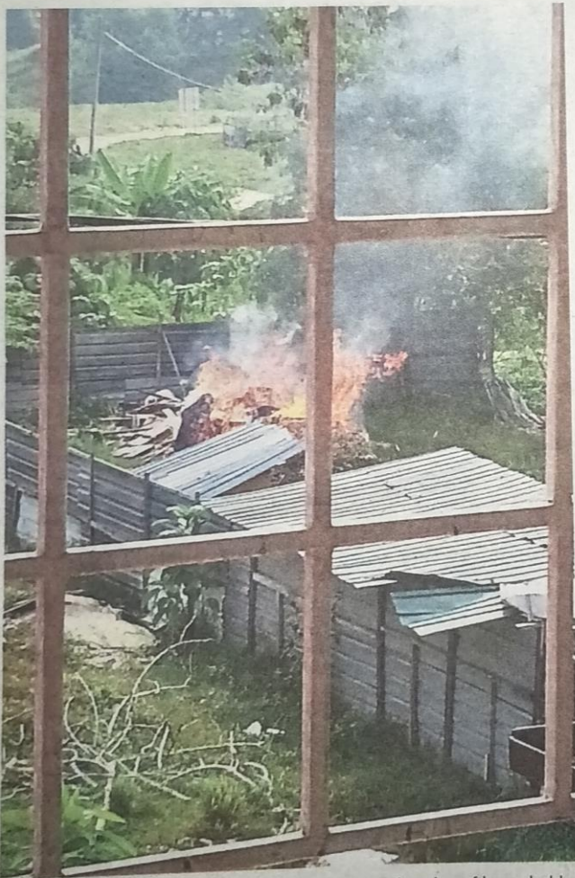
A photo provided by a resident showing the open burning of household and construction waste not far from residential properties.

Jurisdictional problems hamper efforts to deal with environmental issues faced by Ara Damansara residents