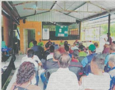
KONTRAKTOR JPS mengadakan pertemuan bersama penduduk Taman Desa Puteri, Kuang baru-baru ini.

"Apabila ada kejadian rumah retak dan roboh, ia sangat sukar untuk dibaiki kerana melibatkan kos yang tinggi. Tiada sebarang jaminan ganti rugi mahupun pampasan yang diberikan oleh JPS kepada penduduk,"