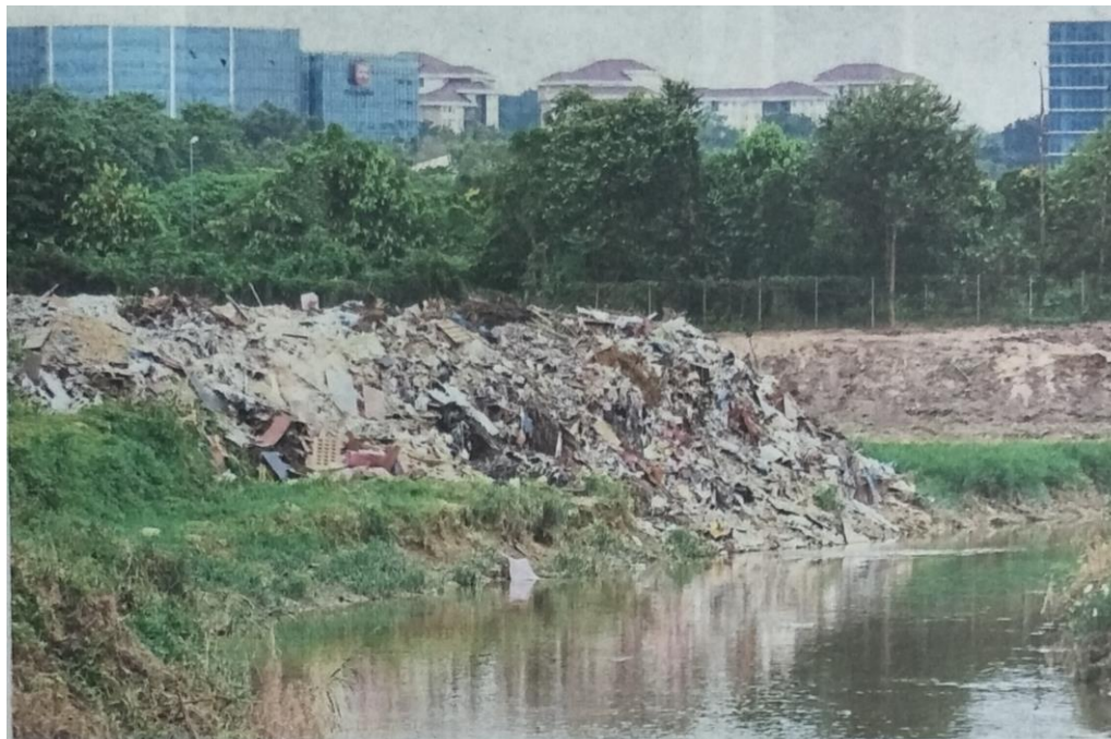
Idaman Ara Damansara residents are appealing to the authorities to come up with a permanent solution to uncontrolled dumping in Sungai Kayu Ara.

birds and hornbills at the river. There were even fireflies in our gardens. Now the river is in such a deplorable and horrible state.”