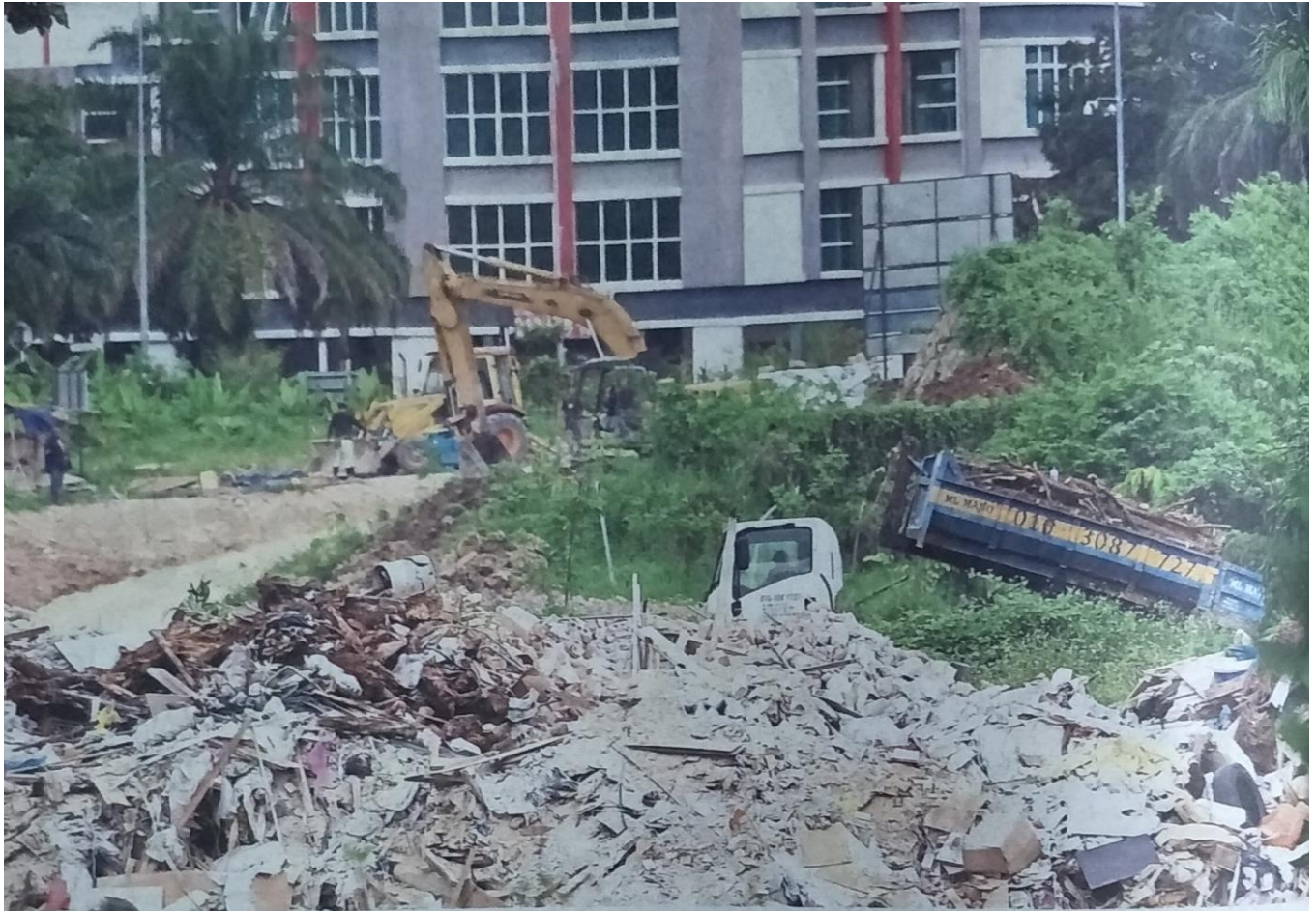
A lorry is seen dumping construction debris and other waste in a vacant spot by the river.